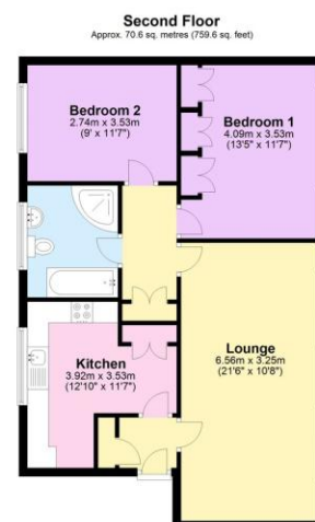
Total area: approx. 70.6 sq. metres (759.6 sq. feet)

Total approx. floor area 828 sq ft (77 sq m)