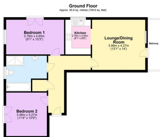
Total area: approx. 65.8 sq. metres (708.6 sq. feet)

Total approx. floor area 708 sq ft (66 sq m)