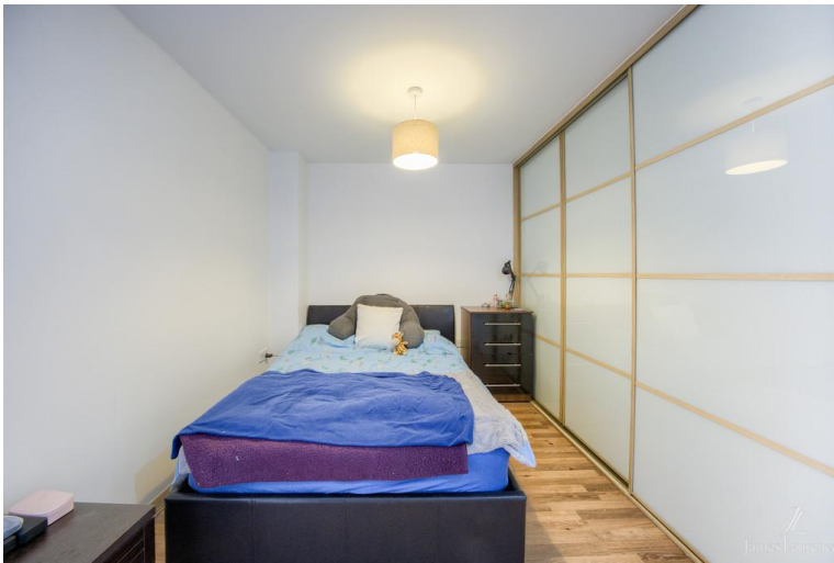
Third Floor Approx. 29.4 sq. metres (316.6 sq. feet)