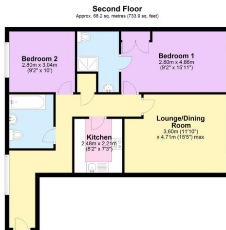
Total area: approx. 68.2 sq. metres (733.9 sq. feet)

Total approx. floor area 734 sq ft (68 sq m)