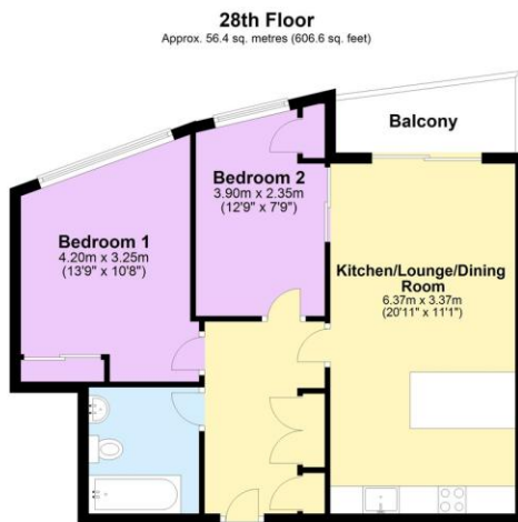
Total area: approx. 56.4 sq. metres (606.6 sq. feet)

Total approx. floor area 606 sq ft (56 sq m)