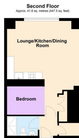
Total area: approx. 41.6 sq. metres (447.5 sq. feet)

Total approx. floor area 447 sq ft (42 sq m)