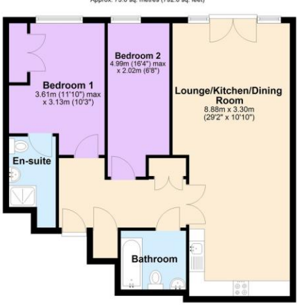
Total area: approx. 73.6 sq. metres (792.6 sq. feet)